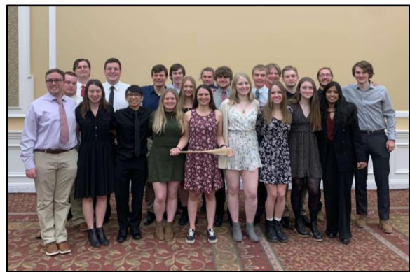
2021-2022 Team at the Regional Competition Banquet

The 2021-2022 Regionals competition took place at Ohio University in Athens, Ohio. The team placed 1 st in Presentation and 2 nd in Races, taking 1 st in Women's Slalom and 2 nd in all other races. Overall, the team placed 3 rd in the region, falling to Youngstown State University and University of Michigan. With a fire lit under them, this season's team is determined to take first this year.