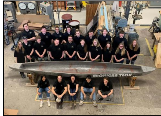
2021-2022 Michigan Tech Concrete Canoe with The Kraken

Prior to competition, the team has to complete multiple design steps involved in constructing a concrete canoe. During the summer, before the season even starts, a hull is designed, with the goal of improving the hull design from last year. Afterwards, at the very beginning of the school year, structural analysis is performed on the hull design. The mix and reinforcement committees use this base structural information in order to prototype and design mix and reinforcements for the final product. These committees are in charge of maintaining the structural integrity during races by testing different combinations of mix and reinforcement leading up to the final canoe construction. Additionally, a theme for the season is chosen. The canoe is constructed all in one day, with the team waking up early in the morning in order to mix and trowel the concrete into the mold, cut in the shape of the designed hull. After the canoe cures, it is decorated in order to match the decided theme. Once the canoe is constructed, the aesthetics committee creates a display table to show information on the canoe and work that has been done throughout the year. This committee also constructs a stand for the canoe to be showcased during the competition. Both the display and stands tie into the annual theme and contribute to the overall competition score.